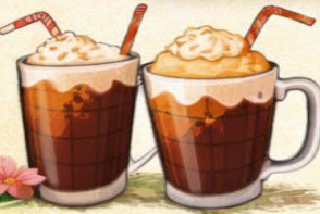
Root Beer Floats