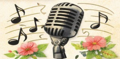
"Name That Tune" Gospel Sing-Along